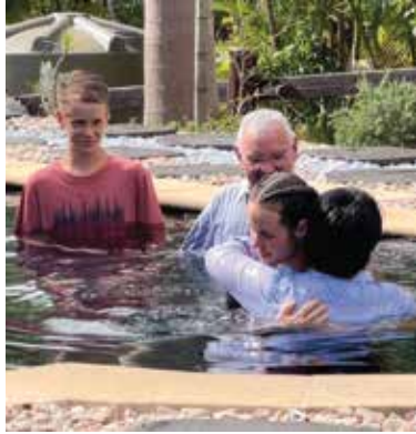
Baptism - Montana