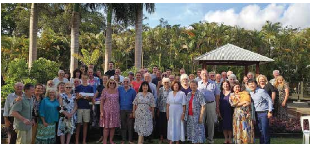
Baptism Group Photo