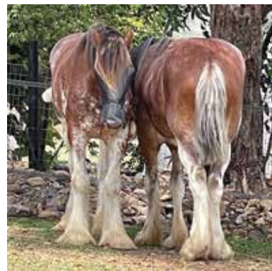
Starlight and Teddy