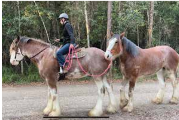
Starlight leading Teddy